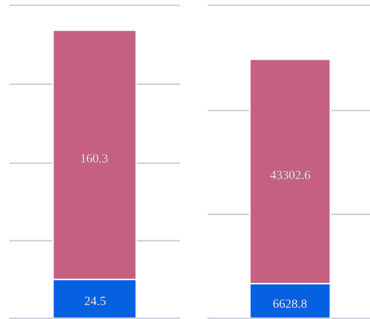
Footprint (tCO2e/£m invested)