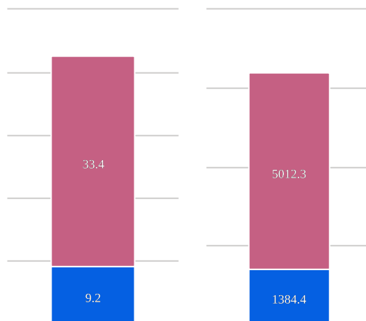
Footprint (tCO2e/£m invested)